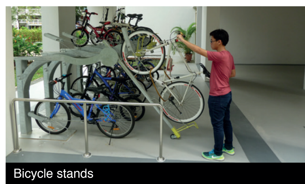
© 2020 Housing & Development Board. All rights reserved.