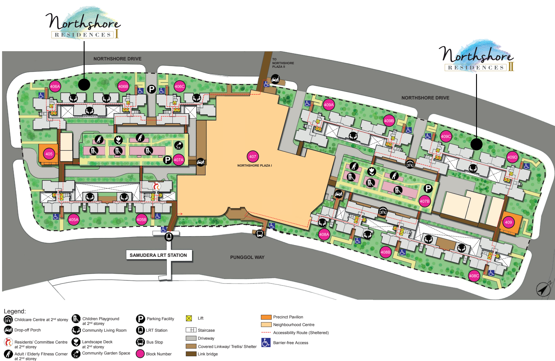
Site plan for Northshore Residences I & II

இந்த இரண்டு மேம்பாடுகளின் பெயர்களும் அவற்றின் அமைவிடங்களை மிகச் சிறப்பாக விவரிக்கின்றன. மேலும், இவை புதிய நார்த்தோர் மாவட்டத்தில் உள்ள முதல் இரண்டு மேம்பாடுகள் என்ற பெருமையையும் கொண்டிருக்கின்றன.