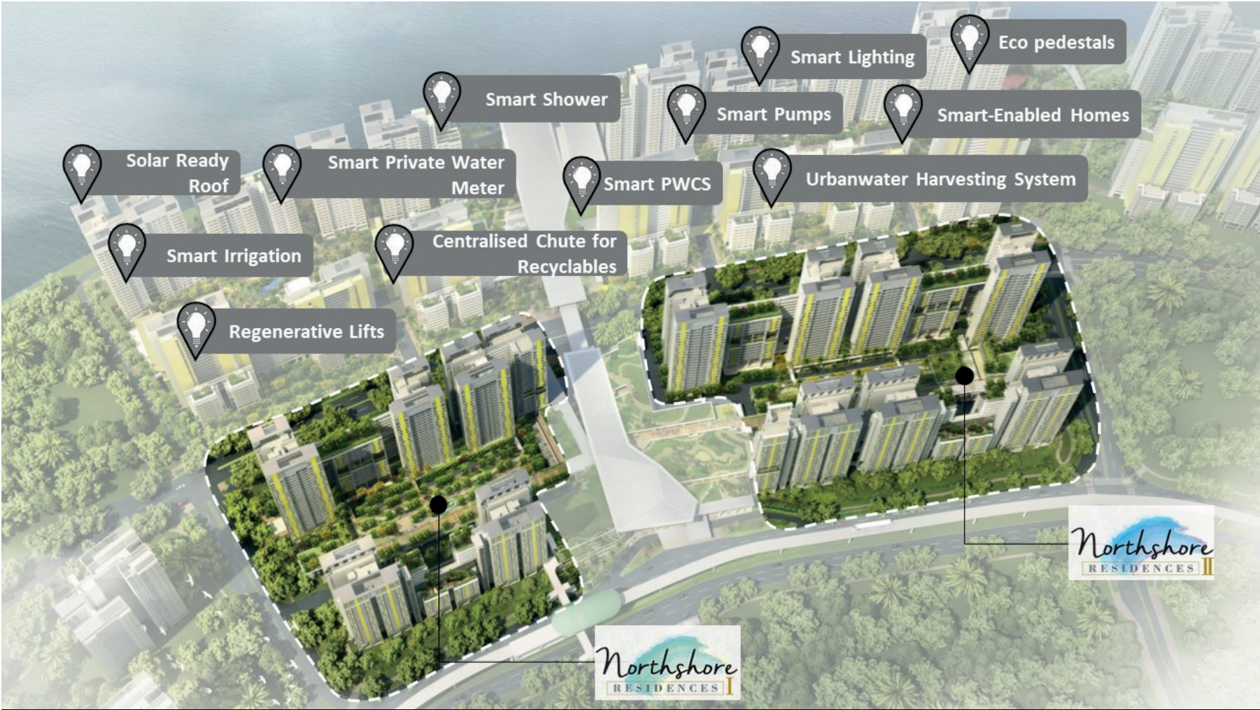
A series of smart and sustainable features in Northshore Residences I and Northshore Residences II

Northshore Residences I and Northshore Residences II are the very first developments designed to fulfil the vision of establishing Punggol as a Smart and Sustainable Town. To support this vision, a series of features are included in these developments to provide a liveable, efficient, sustainable and safe living environment and to encourage residents to adopt a smart and eco-friendly lifestyle.