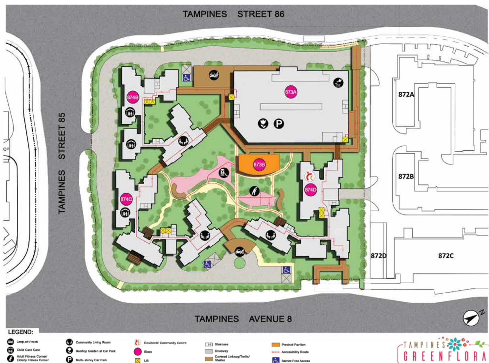
Site plan for Tampines GreenFlora

இந்த மேம்பாட்டின் பசுமையான நிலவடிவமைப்புக் கருத்தாக்கத்தை 'Tampines GreenFlora' என்ற பெயர் விவரிக்கிறது. அடுக்கடுக்காக அமைந்திருக்கும் பசுமையான புல்வெளிக்குள் சமூக வசதிகளும் குடியிருப்பாளர்கள் ஓய்வு நேரங்களில் ஒன்றிணைந்து ஈடுபடக்கூடிய இடங்களும் இடம்பெற்றுள்ளன.