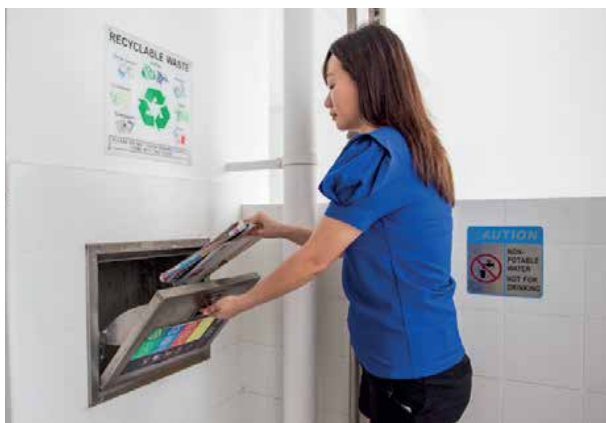
Separate chutes for recyclable waste

To encourage residents to adopt a green and eco-friendly lifestyle, the development is designed with several eco-friendly features. This include separate chutes for recyclable waste, motion sensor-controlled energy efficient lighting at staircases to reduce energy consumption, eco-pedestals in bathrooms to encourage water conservation, bicycle stands to encourage cycling as an environmentally friendly form of transport, etc.