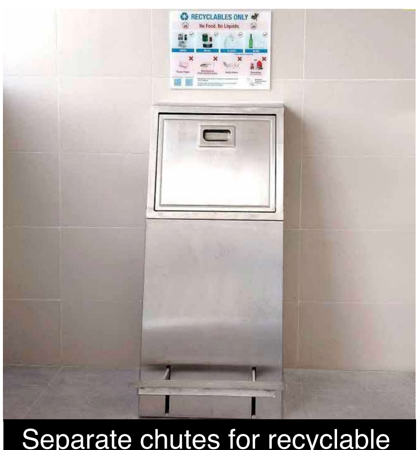
Separate chutes for recyclable waste

Tampines GreenOpal also features Smart solutions for a more liveable, efficient, sustainable, and safe living environment. These include Smart Lighting in common areas to reduce energy usage; and Smart Pneumatic Waste Conveyance Systems to optimize the deployment of resources for cleaner and fuss-free waste disposal.