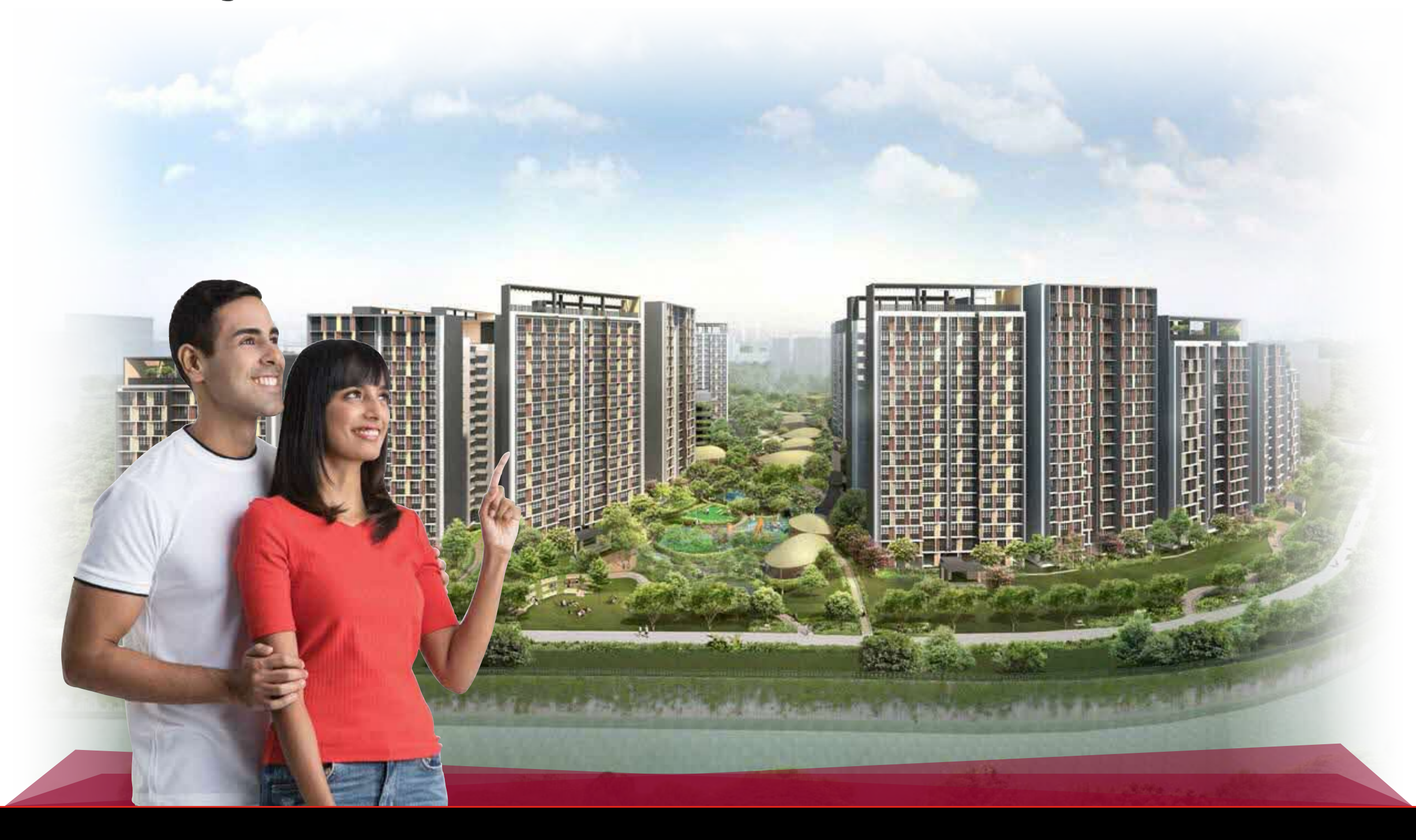
© 2025 Housing & Development Board. All rights reserved.