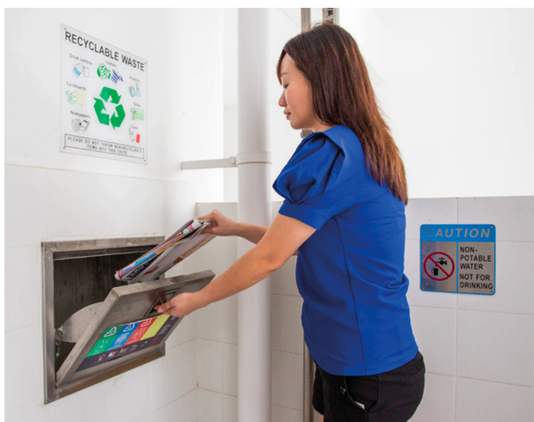
Separate chutes for recyclable waste

Dakota One also features Smart solutions for a more liveable, efficient, sustainable, and safe living environment. These include Smart Lighting in common areas to reduce energy usage, and contribute to a sustainable and safer living environment.