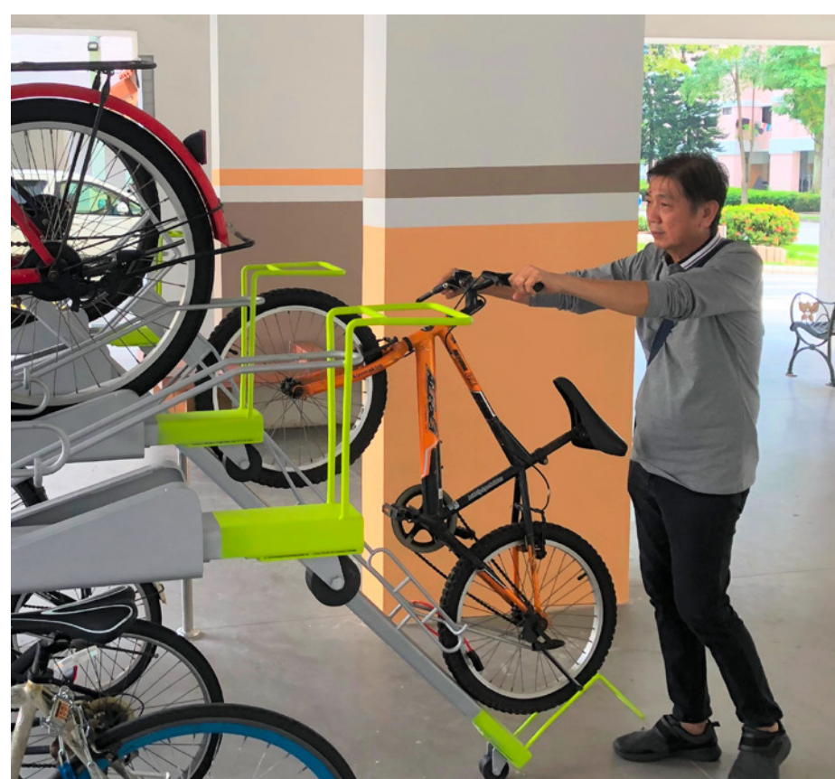
Bicycle stands to encourage cycling