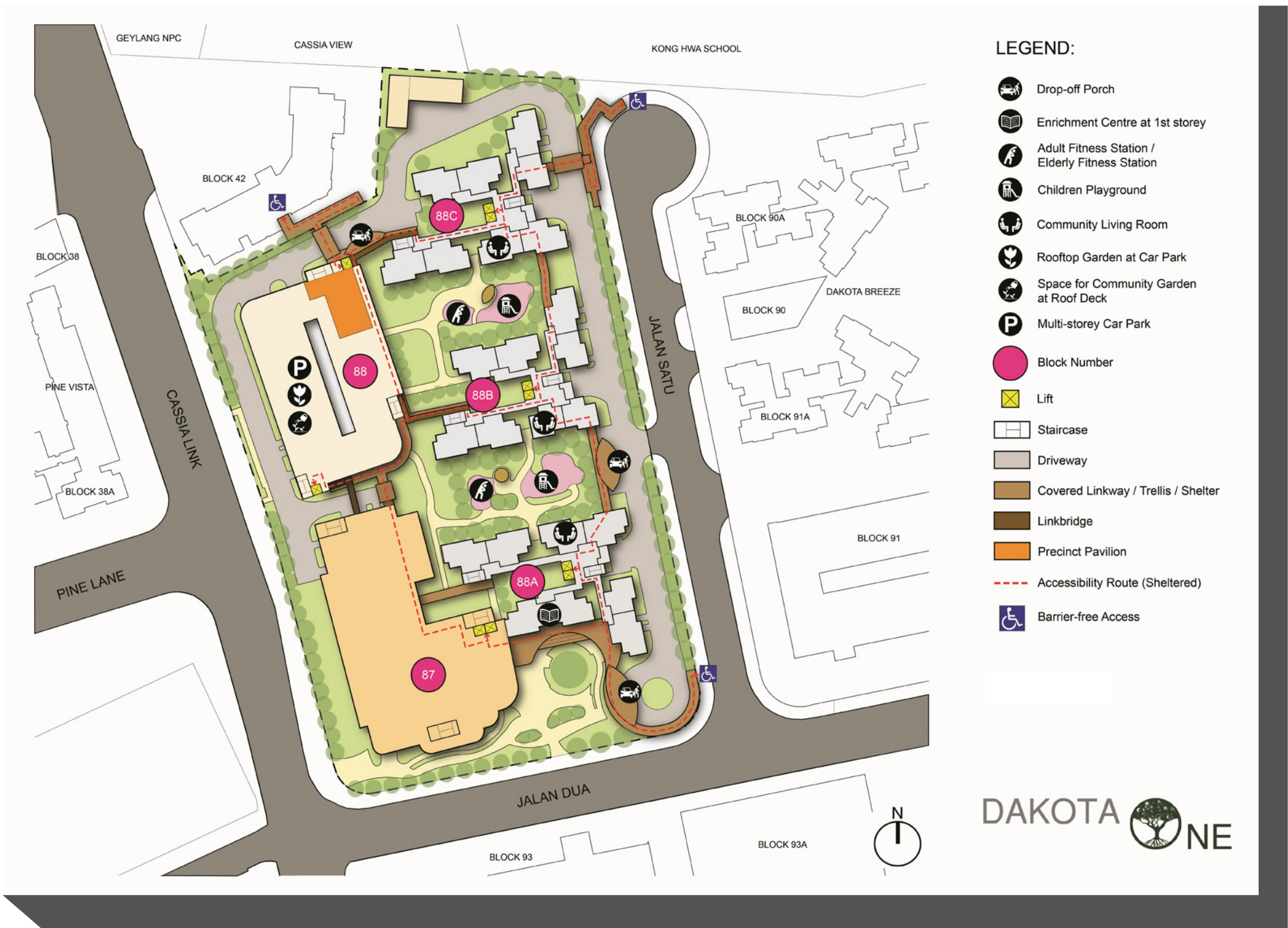
Site plan for Dakota One

இந்த குடியிருப்பு ஒரு புதிய சமூக மன்றத்தோடு ஒருங்கிணைக்கப்பட்டுள்ளது. இதன் வசதிகளை குடியிருப்பாளர்கள் எளிதாக அனுபவிக்க முடியும்.