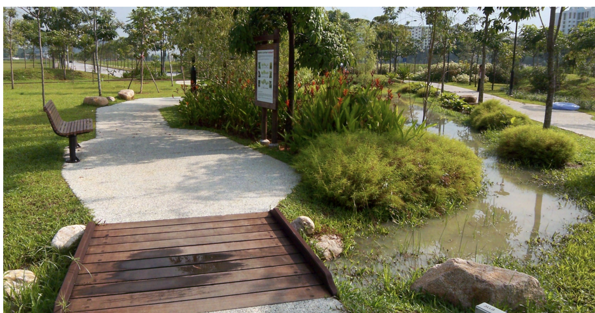
ABC Waters design features

© 2025 Housing & Development Board. All rights reserved.