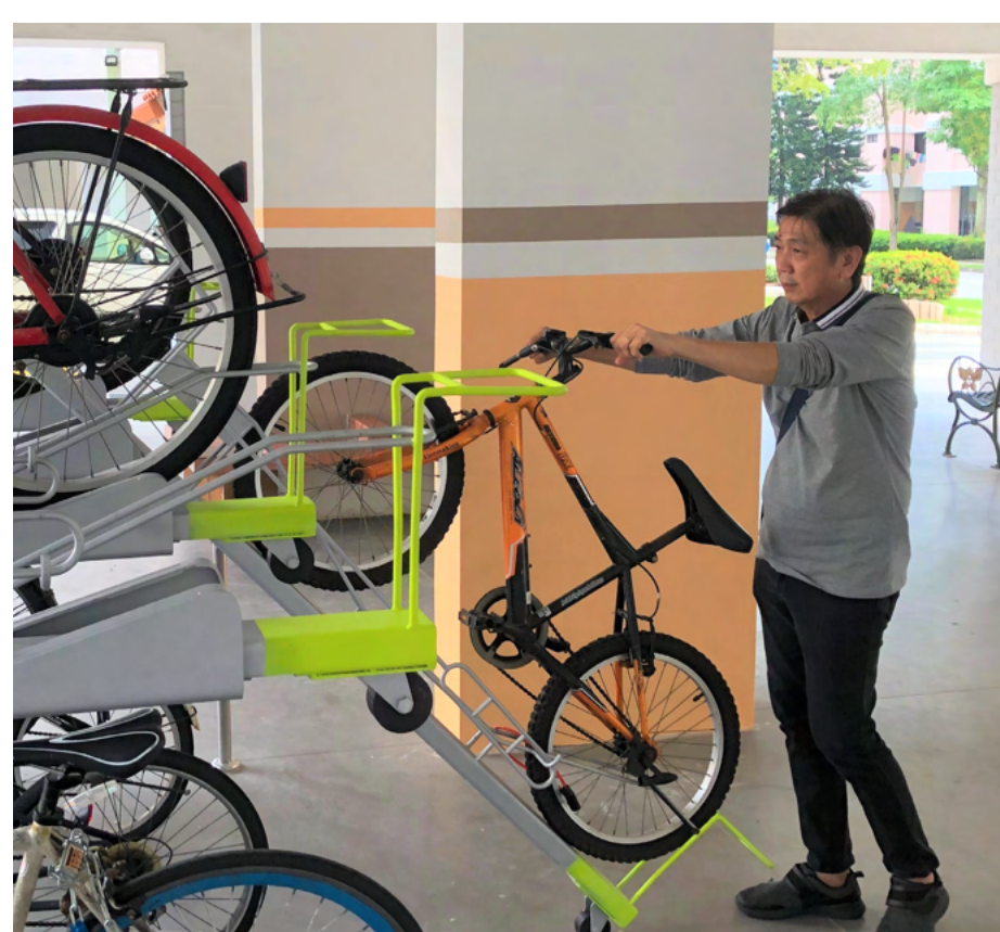
Bicycle stands to encourage cycling