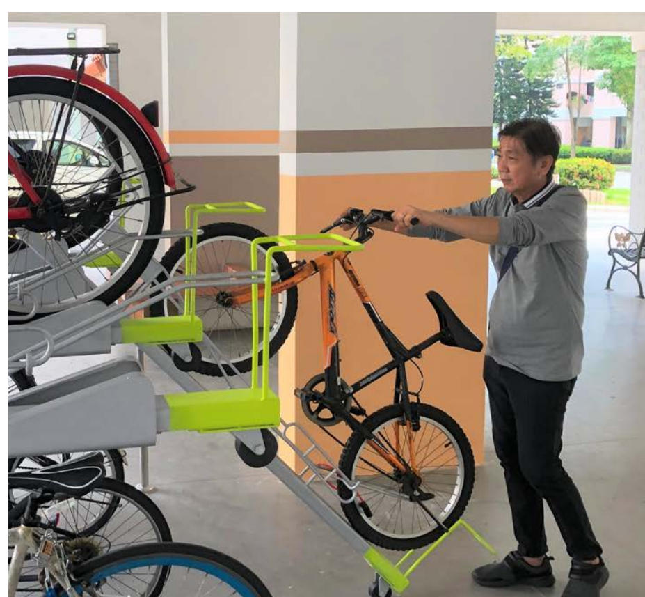
Bicycle stands to encourage cycling