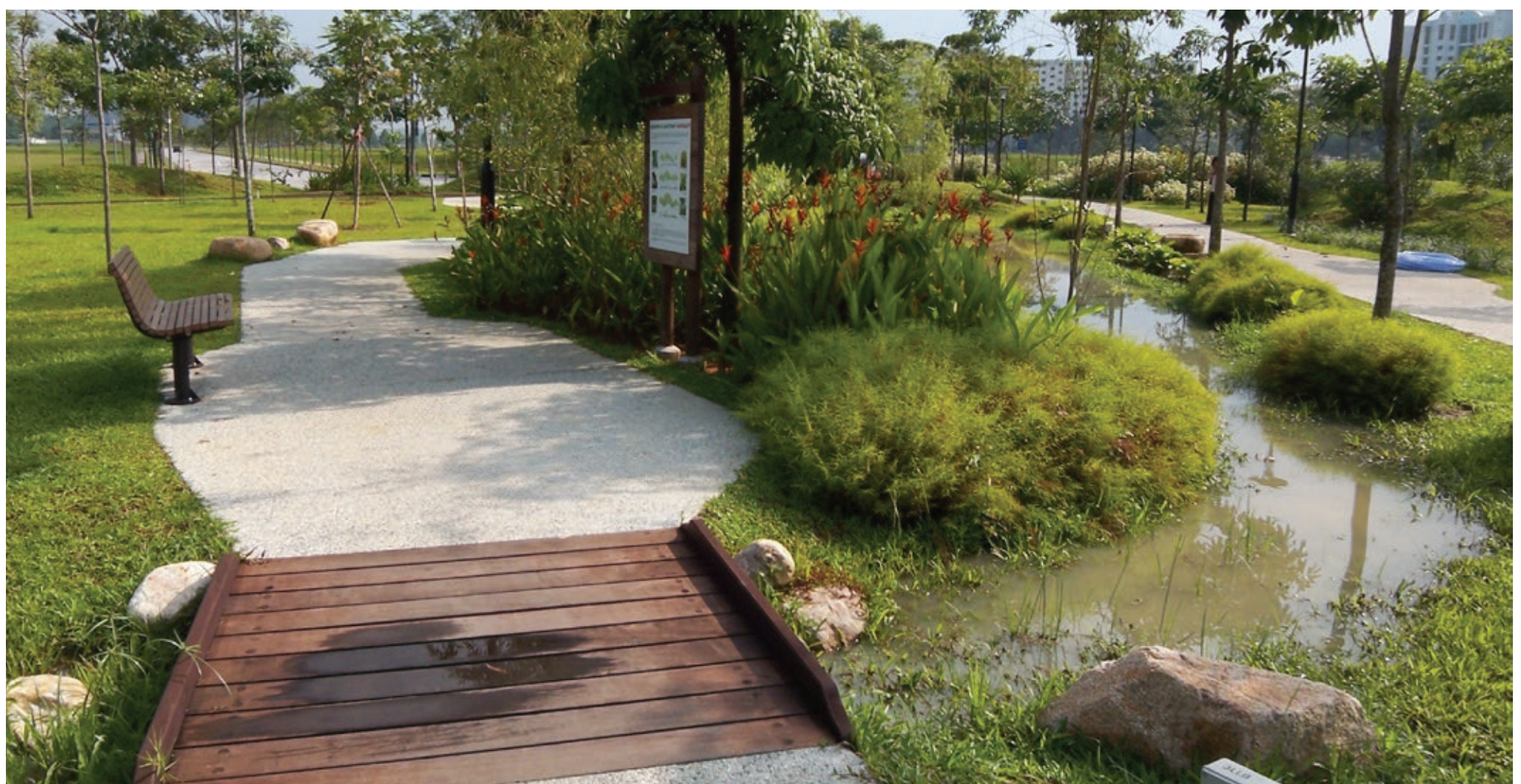
ABC Waters design features