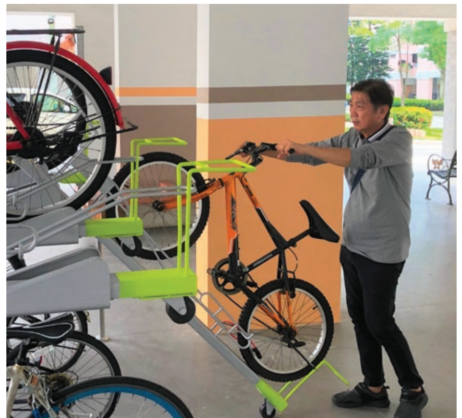
Bicycle stands to encourage cycling