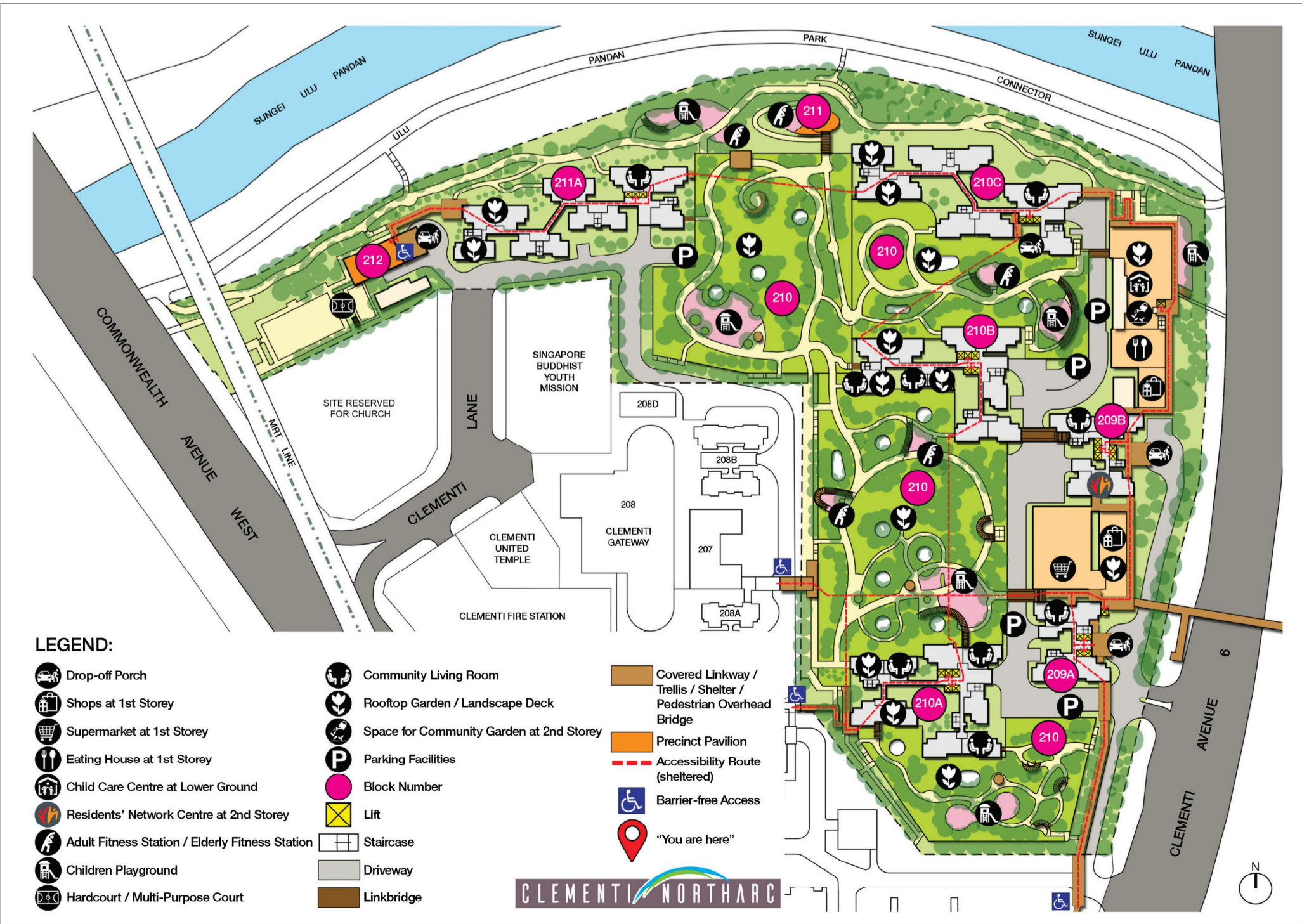
Site plan for Clementi NorthArc

"Clementi NorthArc" என்ற பெயர் ஒரு வில் வடிவிலான மேம்பாட்டையும், கிளமெண்டி நகரத்தின் வடக்குப் பகுதியில் அதன் இருப்பிடத்தையும் பிரதிபலிக்கிறது.