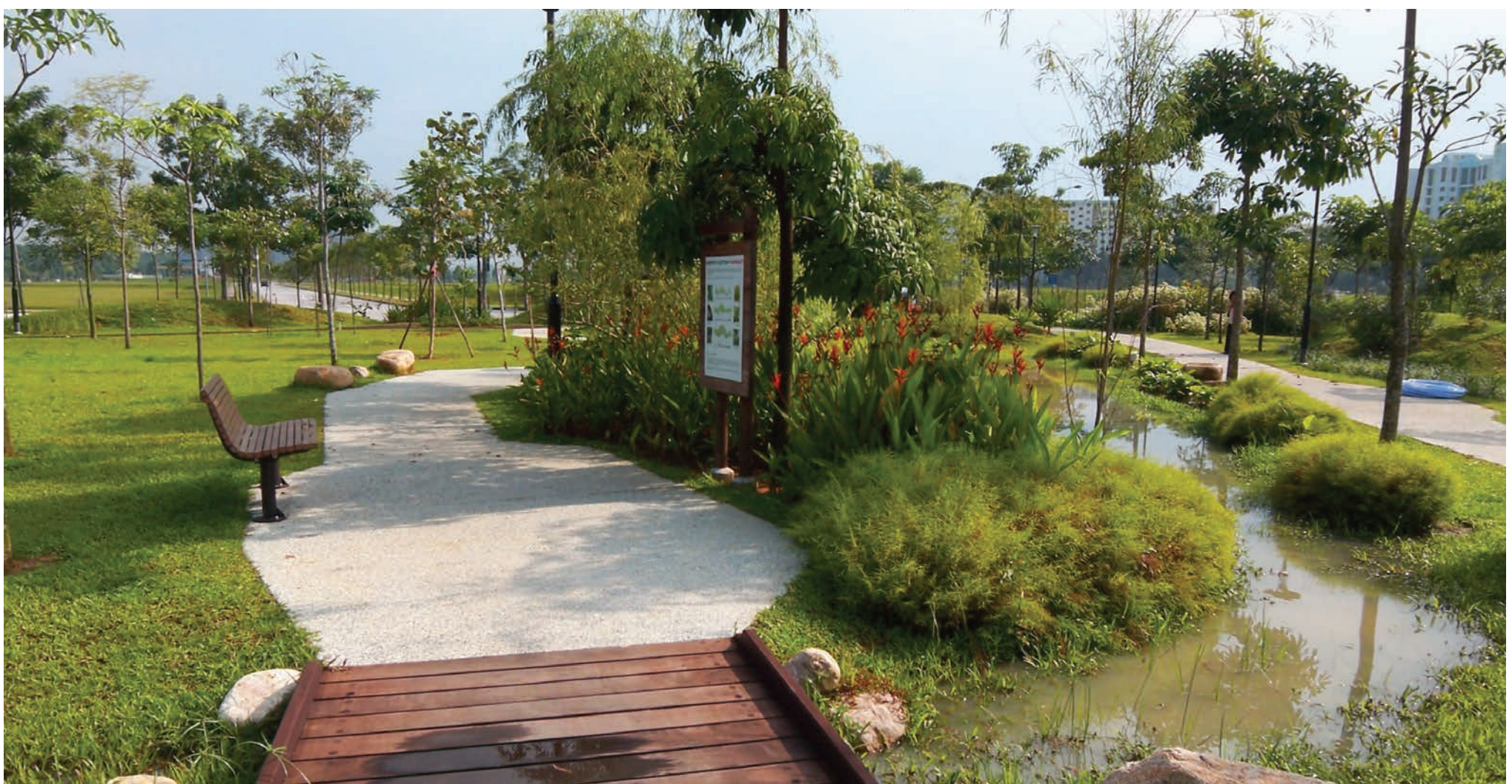
ABC Waters design features

© 2022 Housing & Development Board. All rights reserved.