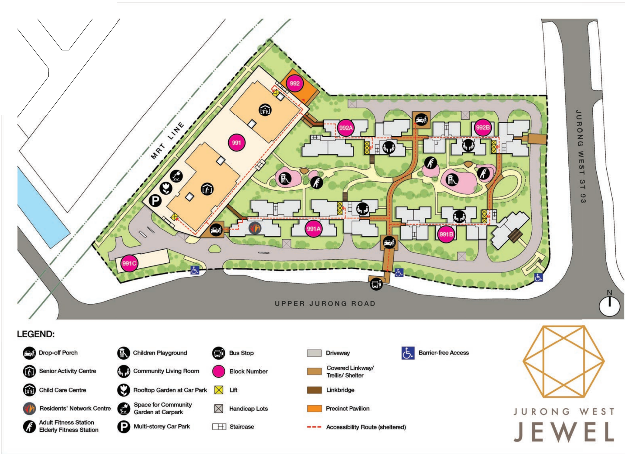
Site plan for Jurong West Jewel

Jurong West Jewel-இன் கட்டட முகப்பானது ரத்தினங்களை உத்வேகமாகக் கொண்டு வடிவமைக்கப்பட்டது. அப்பர் ஜூரோங் ரோடு மற்றும் ஜூரோங் வெஸ்ட் ஸ்ட்ரீட் 93 ஆகியவை சூழ அமைந்துள்ள Jurong West Jewel-இல் 12 முதல் 18 மாடிகளைக் கொண்ட 4 குடியிருப்புப் புளோக்குகள் அமைந்துள்ளன. இவற்றில் 2-அறை ஃப்ளெக்ஸி, 3-அறை, 4-அறை மற்றும் 5-அறை என மொத்தம் 599 குடியிருப்புகள் உள்ளன.