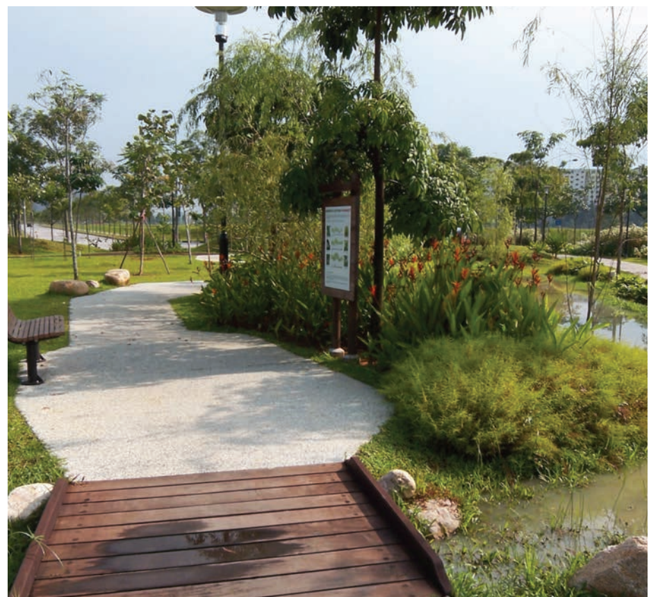
ABC Waters design features