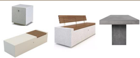
CLR Seats and Table for Social Gathering

Community Living Rooms (CLR) are designed with furniture, overlooking to the Green spaces for residents to enjoy the nature and socialize