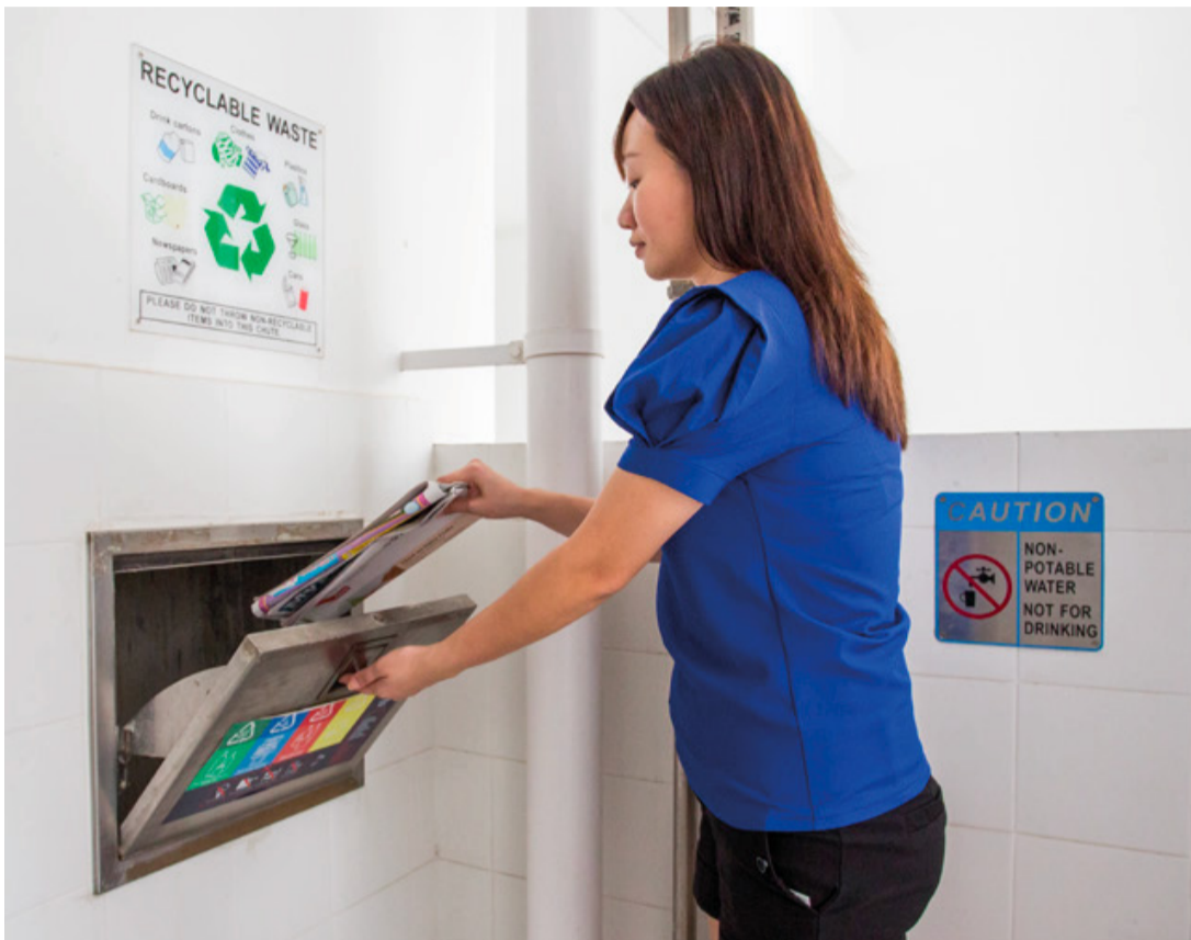
Separate chutes for recyclable waste

To encourage a green and sustainable lifestyle among residents, MacPherson Blossom is designed with several eco-friendly features such as separate chutes for recyclable waste; bicycle stands to encourage cycling as an environmentally friendly form of transport; parking spaces to facilitate car-sharing schemes; smart lighting and regenerative lifts in common areas to reduce energy usage; use of sustainable and recycled products in the development; ABC Waters design feature to clean rainwater and beautify the landscapes.