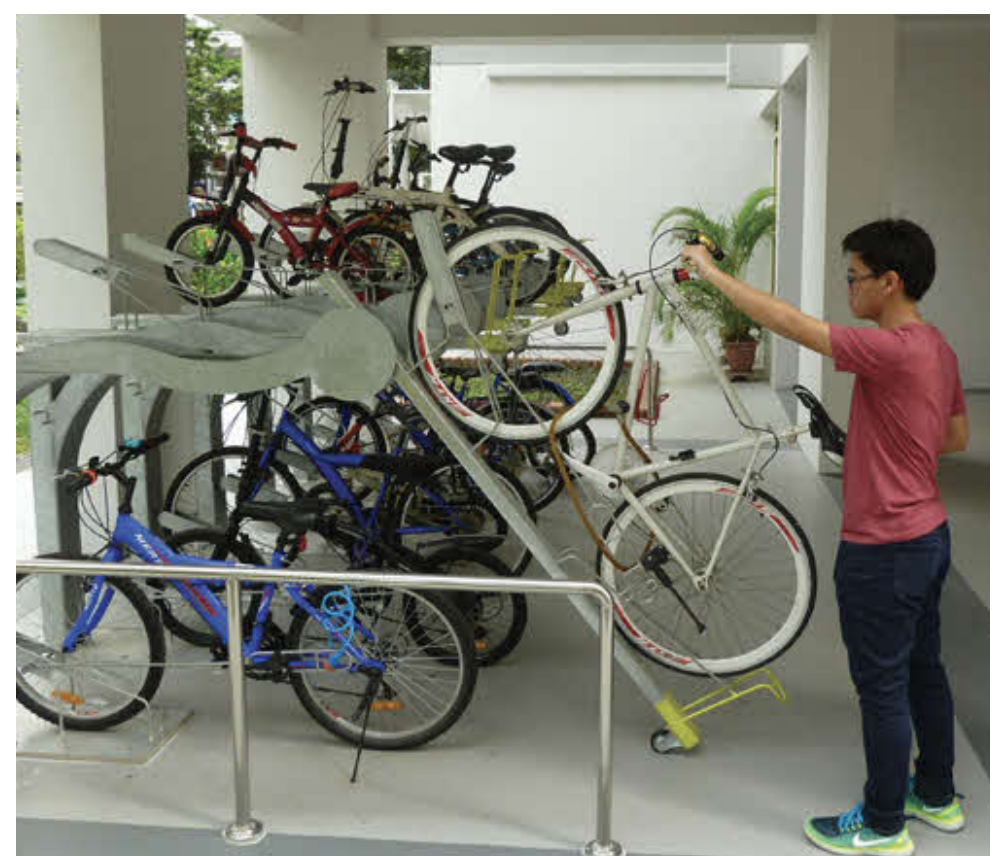
Bicycle stands to encourage cycling