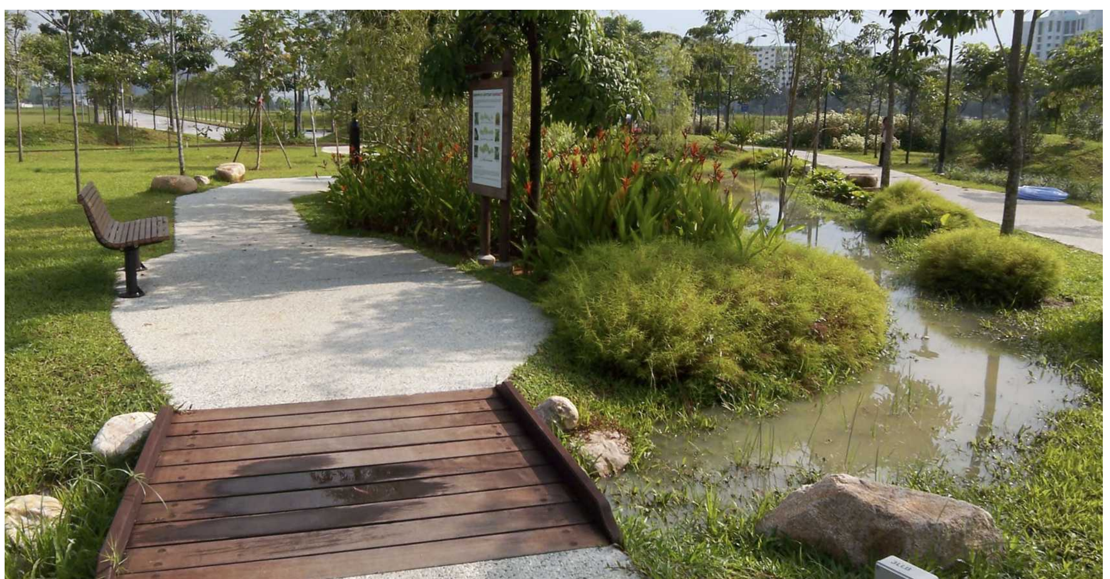
ABC Waters design features

© 2023 Housing & Development Board. All rights reserved.