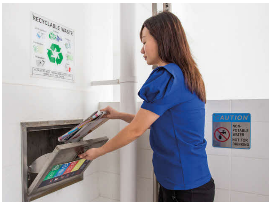
Separate chutes for recyclable waste

Residents may subscribe to have air conditioning provided from a centralised cooling system which is the first of its kind for public housing in Singapore. Highly energy-efficient chillers will cool each household, easing you the need to install and maintain outdoor condensing units on the air-conditioner ledge, thereby, enjoying cost savings while contributing to a sustainable lifestyle in this eco-friendly district. Residents may find out more from SP Group at tengahcooling@spgroup.com.sg .