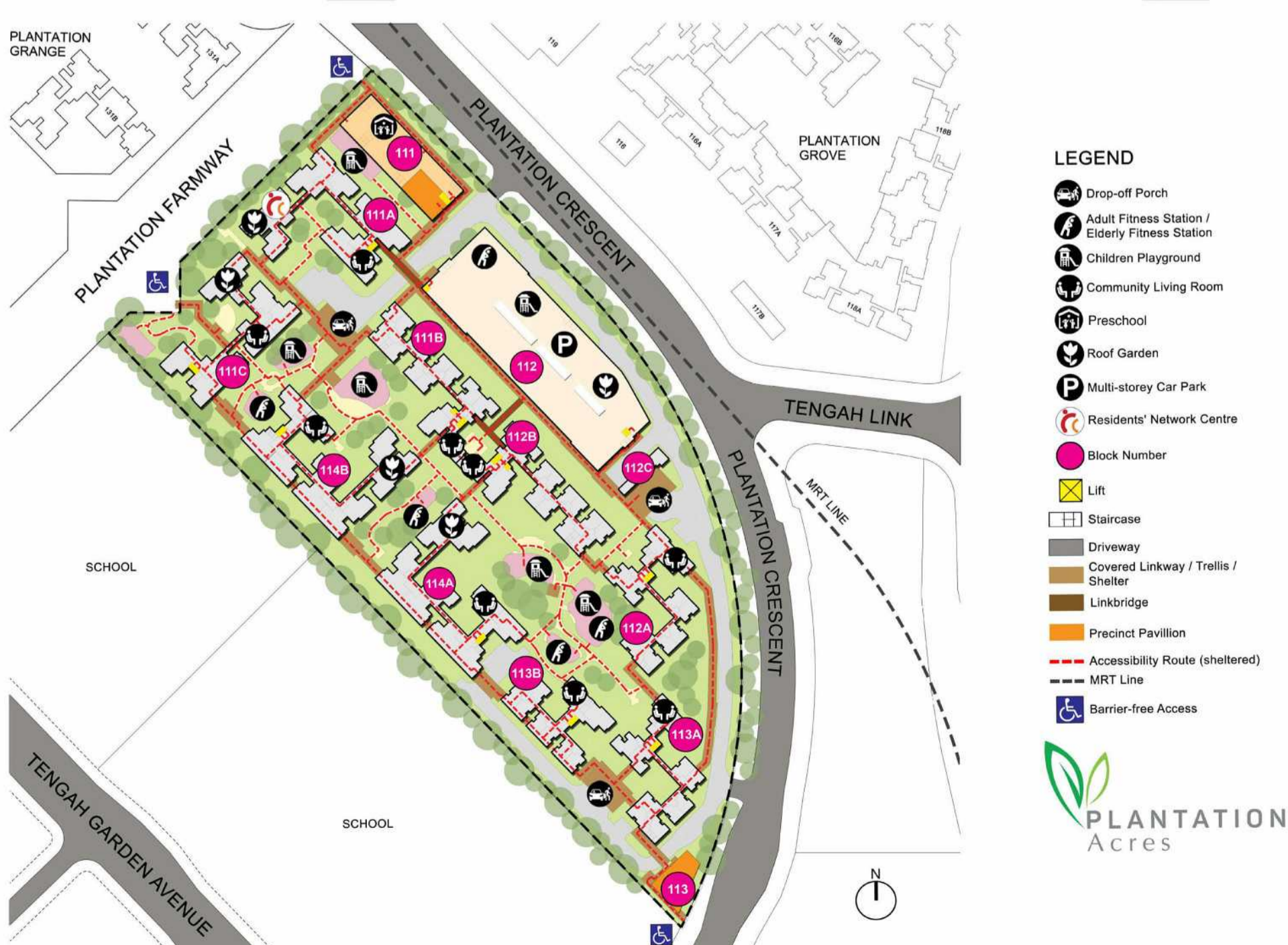
Site plan for Plantation Acres

இந்த மேம்பாட்டிற்குள் காணப்படும் பசுமை வெளிகள் மற்றும் நகரத்திற்குள் காணப்படும் பிற இயற்கையான இடங்களால் ஈர்க்கப்பட்டு, ஒரு பரபரப்பான நாளுக்குப் பிறகு குடியிருப்பாளர்கள் ஓய்வெடுக்கவும் இளைப்பாறவும் ஒரு பசுமையான வாழ்விடமாக விளங்குவதற்கு இந்த Plantation Acres வடிவமைக்கப்பட்டுள்ளது.