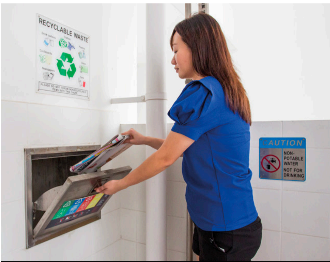
Separate chutes for recyclable waste

To encourage a 'green and smart' lifestyle and fulfil the vision of Punggol as an Eco-Town, Punggol Point Crown is designed with several eco-friendly features such as separate chutes for recyclable wastes; Smart Pneumatic Waste Conveyance System to optimise the resources for cleaner and fuss-free waste disposal; motion sensor-controlled energy efficient lighting at staircases; regenerative lifts to reduce energy consumption; rainwater harvesting system to store rainwater for washing of common areas; ABC Waters design features to clean rainwater and beautify the landscape; bicycle stands to encourage cycling as an environmentally friendly form of transport; and use of sustainable and recycled products in the development.