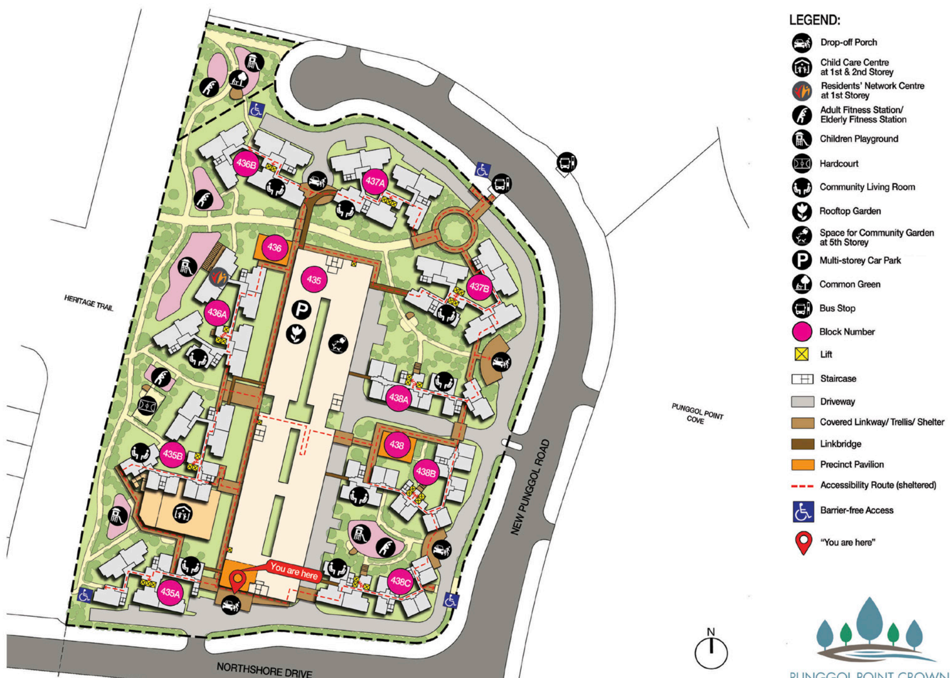
Site plan for Punggol Point Crown

அருகிலுள்ள பொங்கோல் மரபுடைமைப் பாதையின் கிரீடம் போன்ற மரங்களின் அமைப்பினாலும், மேம்பாட்டின் நிலத்தோற்றத்தாலும் பொங்கோல் பாய்ண்ட் கிரவுன் (Punggol Point Crown) என்று இதற்குப் பெயர் சூட்டப்பட்டுள்ளது.