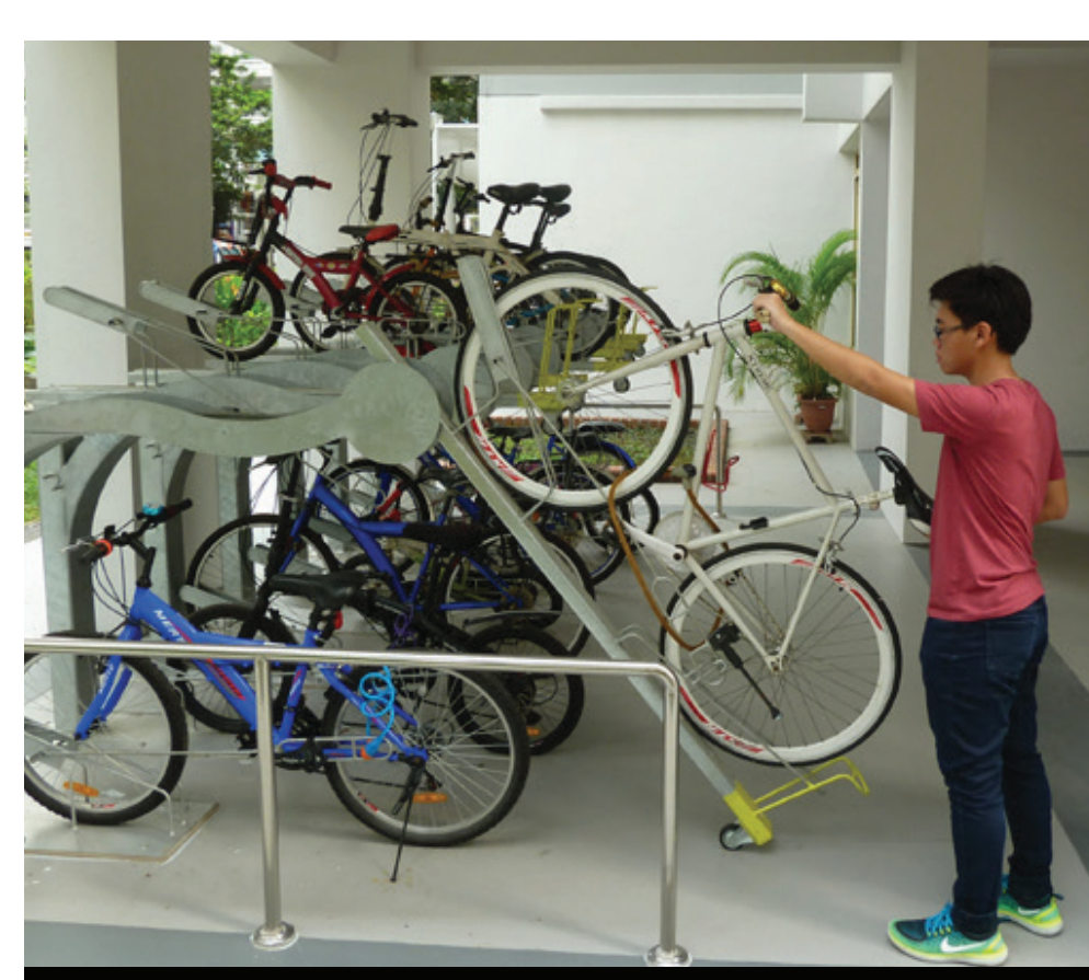
Bicycle stands to encourage cycling