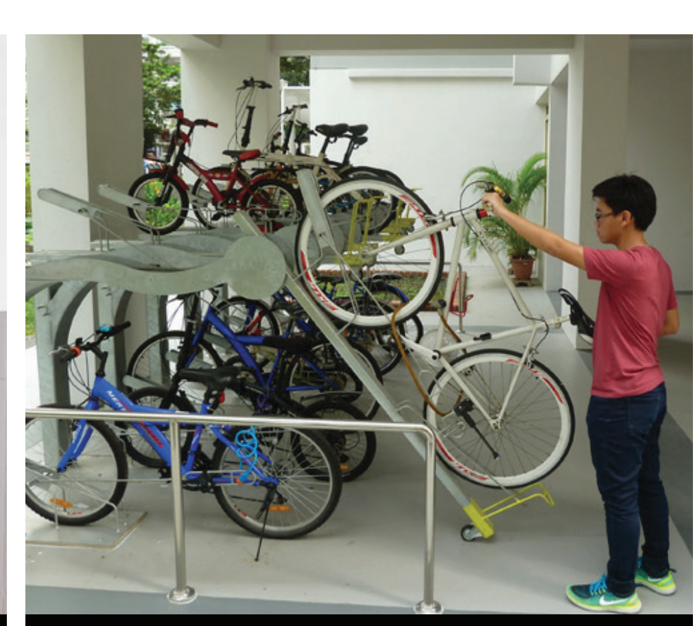
Bicycle stands to encourage cycling