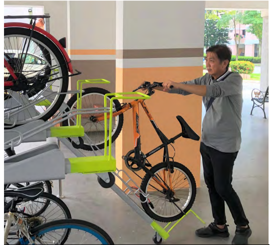
Bicycle stands to encourage cycling