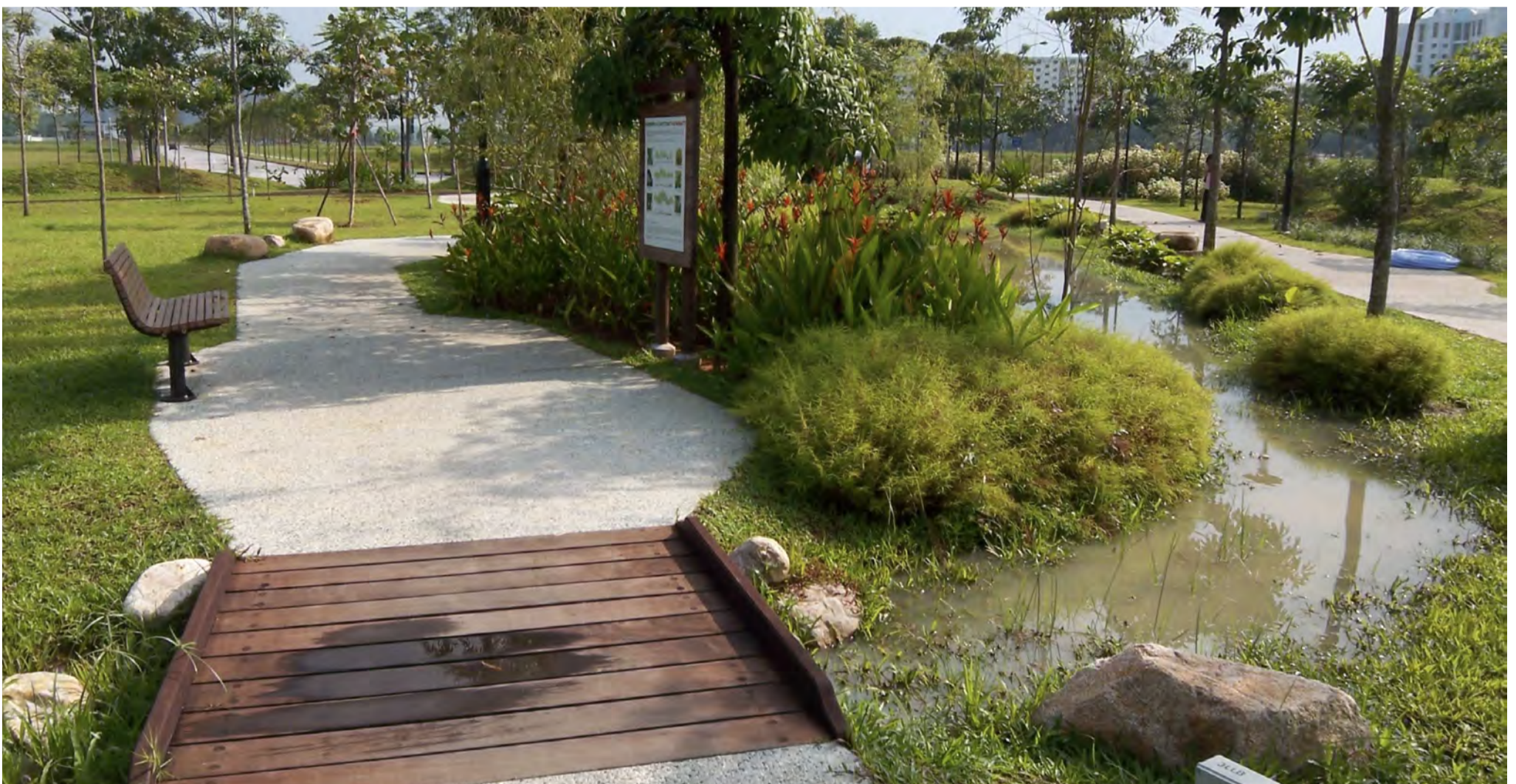
ABC Waters design features