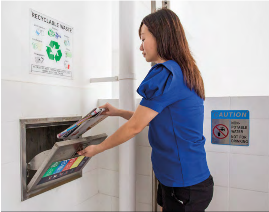
Separate chutes for recyclable waste

To encourage a 'green and smart' lifestyle and fulfil the vision of Punggol as an Eco-Town, Punggol Point Cove is designed with several eco-friendly features such as separate chutes for recyclable wastes; Smart Pneumatic Waste Conveyance System to optimize the deployment of resources for cleaner and fuss-free waste disposal; motion sensor-controlled energy efficient lighting at staircases; regenerative lifts to reduce energy consumption; rainwater harvesting system to store rainwater for washing of common areas; ABC Waters design features to clean rainwater and beautify the landscape; bicycle stands to encourage cycling as an environmentally friendly form of transport; and use of sustainable and recycled products in the development.