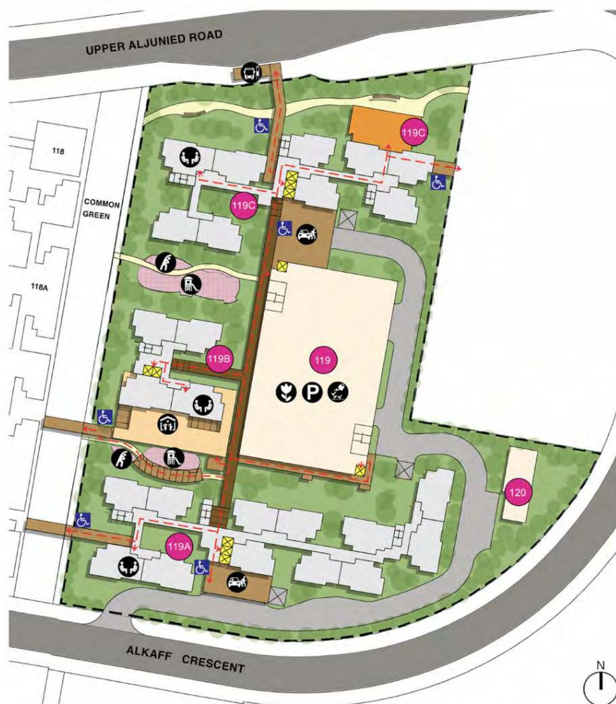
Site plan for Alkaff Breeze

செழிப்பான நிலவடிவமைப்பைக் கொண்ட இப்பேட்டை பசுமையாகவும் அனைத்து வசதிகளுடனும் இருப்பதால் இதற்கு 'அல்காஃப் ப்ரீஸ்' என்னும் பெயர் சூட்டப்பட்டது.