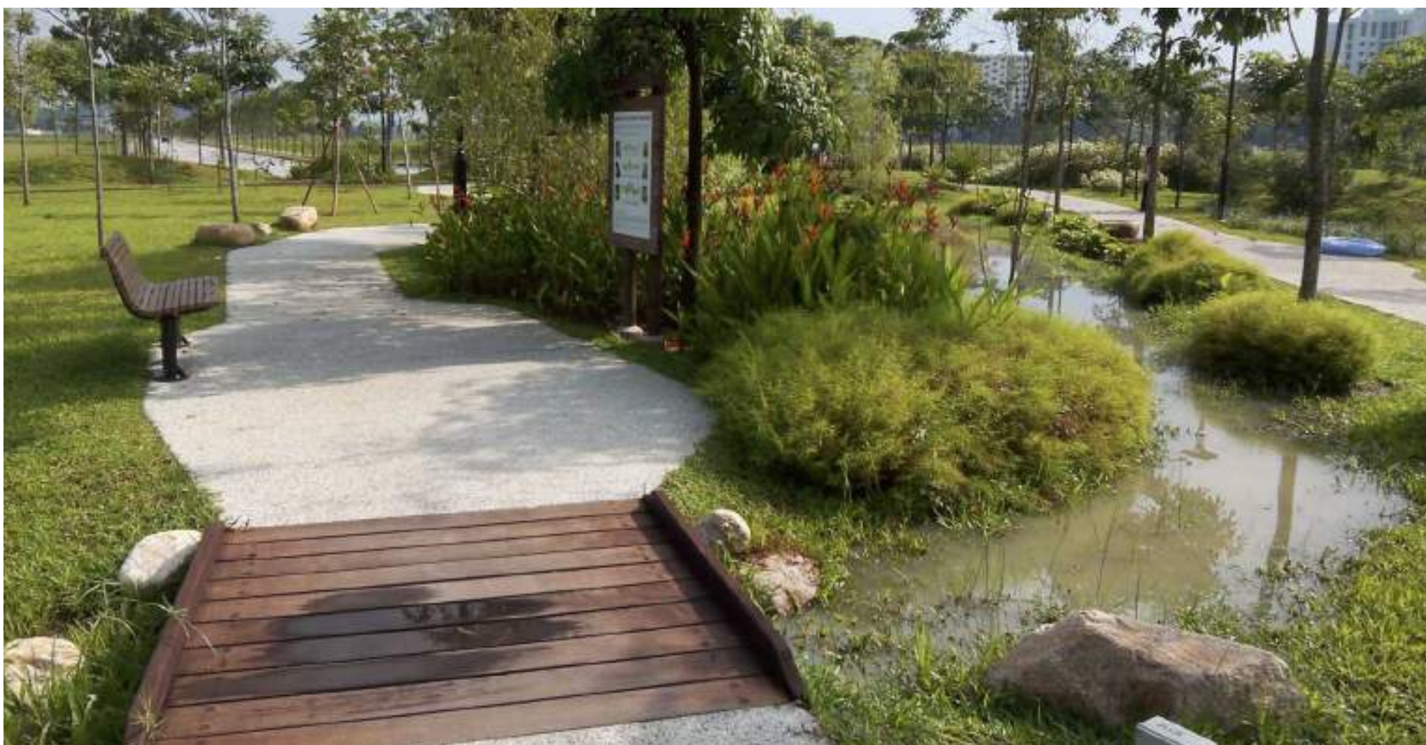
ABC Waters design features