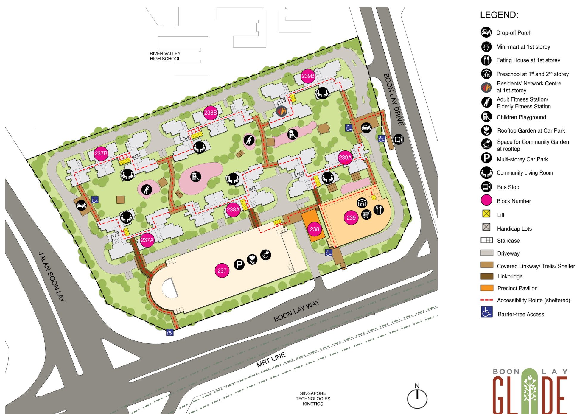
Site plan for Boon Lay Glade

'Boon Lay Glade' என்ற பெயரானது, மேம்பாட்டின் பசுமை வெளிகளால் ஈர்க்கப்பட்டு பெயரிடப்பட்டுள்ளது.