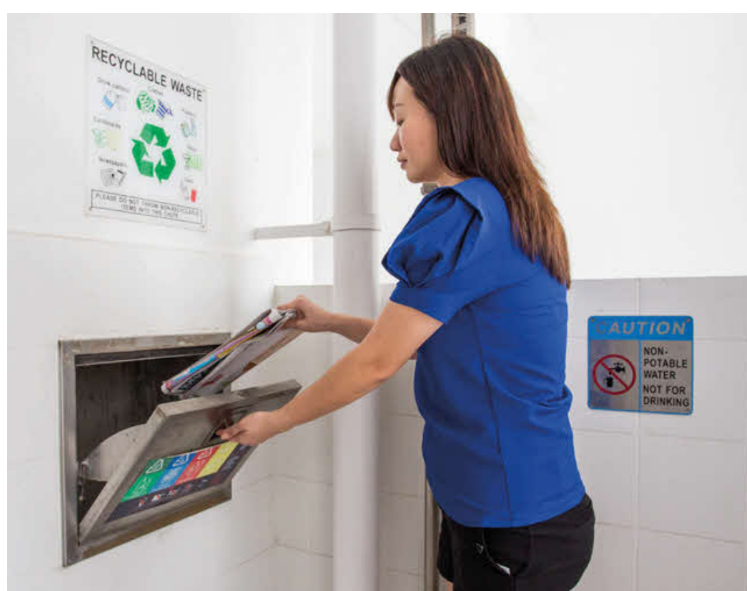
Separate chutes for recyclable waste