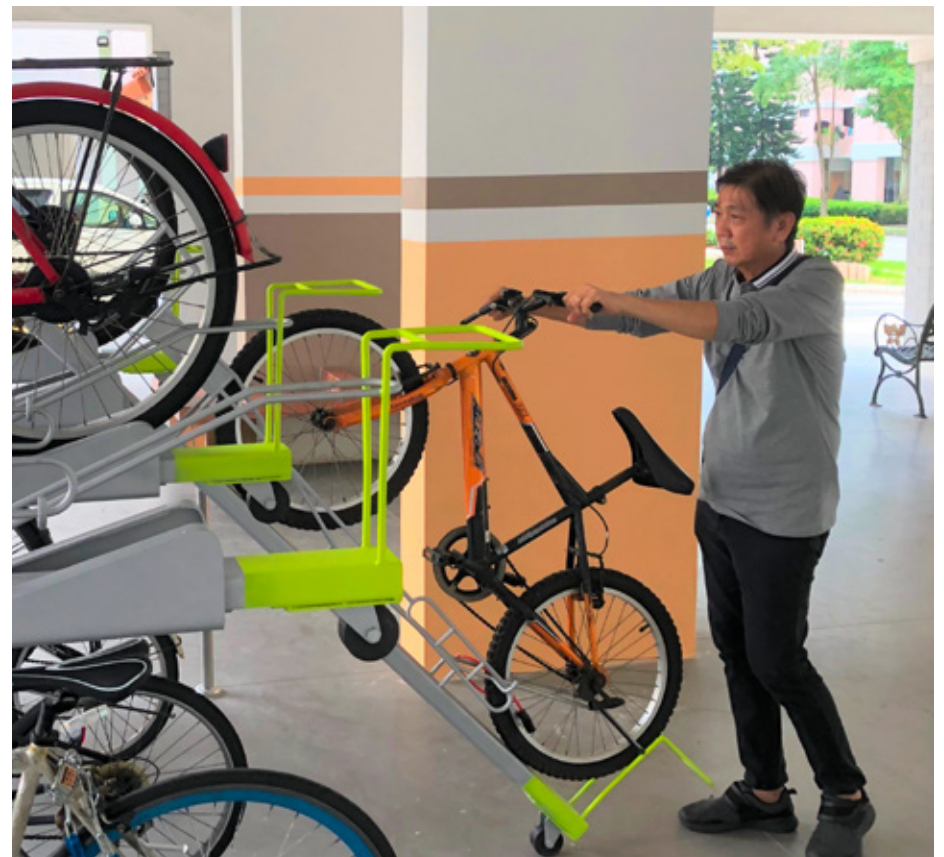
Bicycle stands to encourage cycling