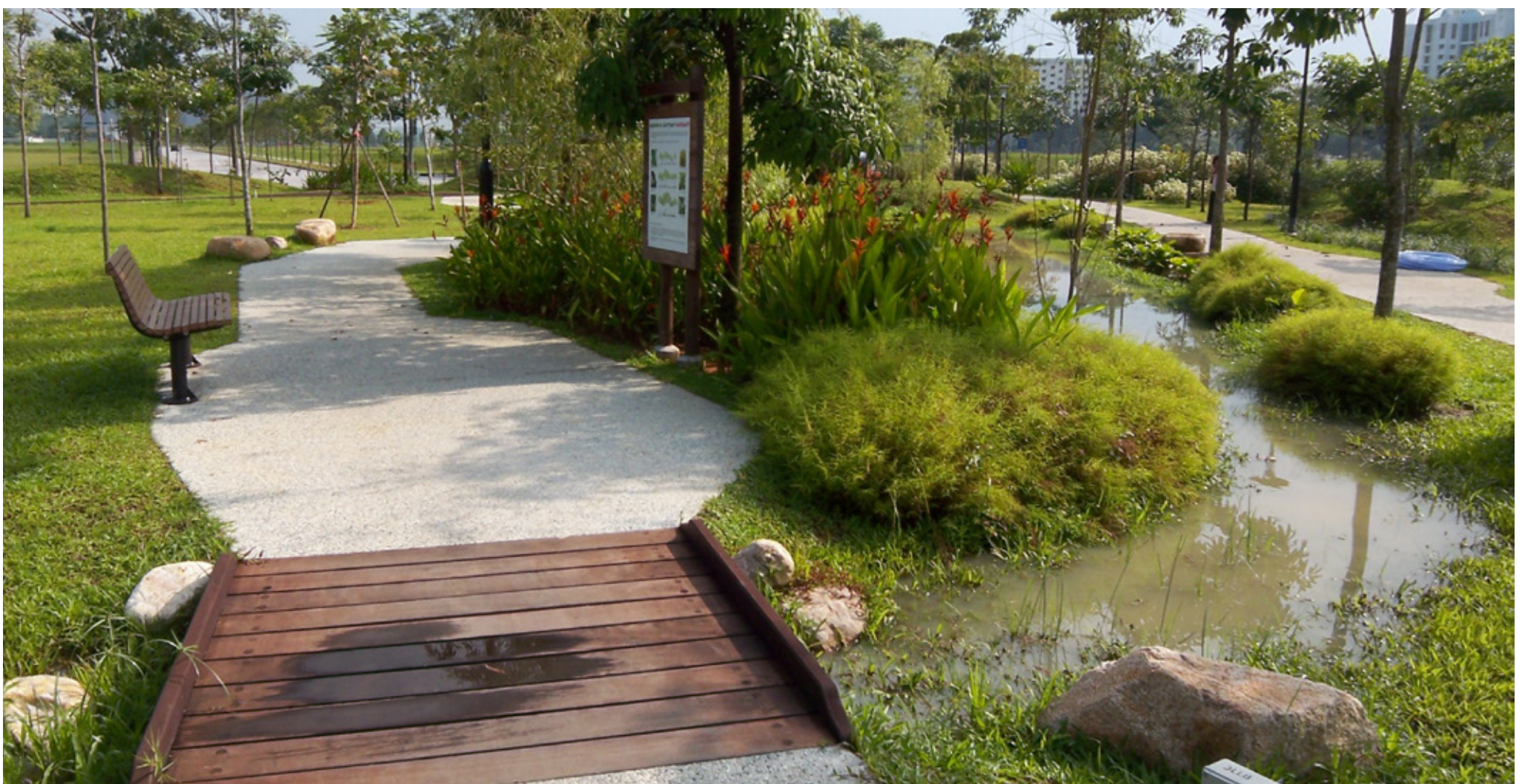
ABC Waters design features

© 2024 Housing & Development Board. All rights reserved.