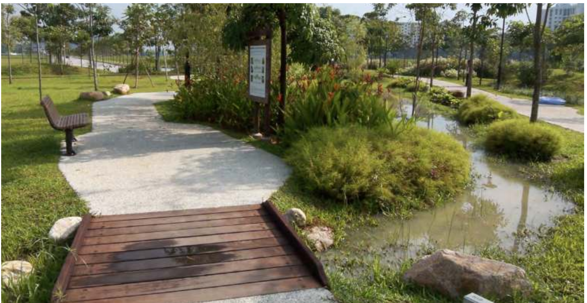
ABC Waters design features

© 2024 Housing & Development Board. All rights reserved.