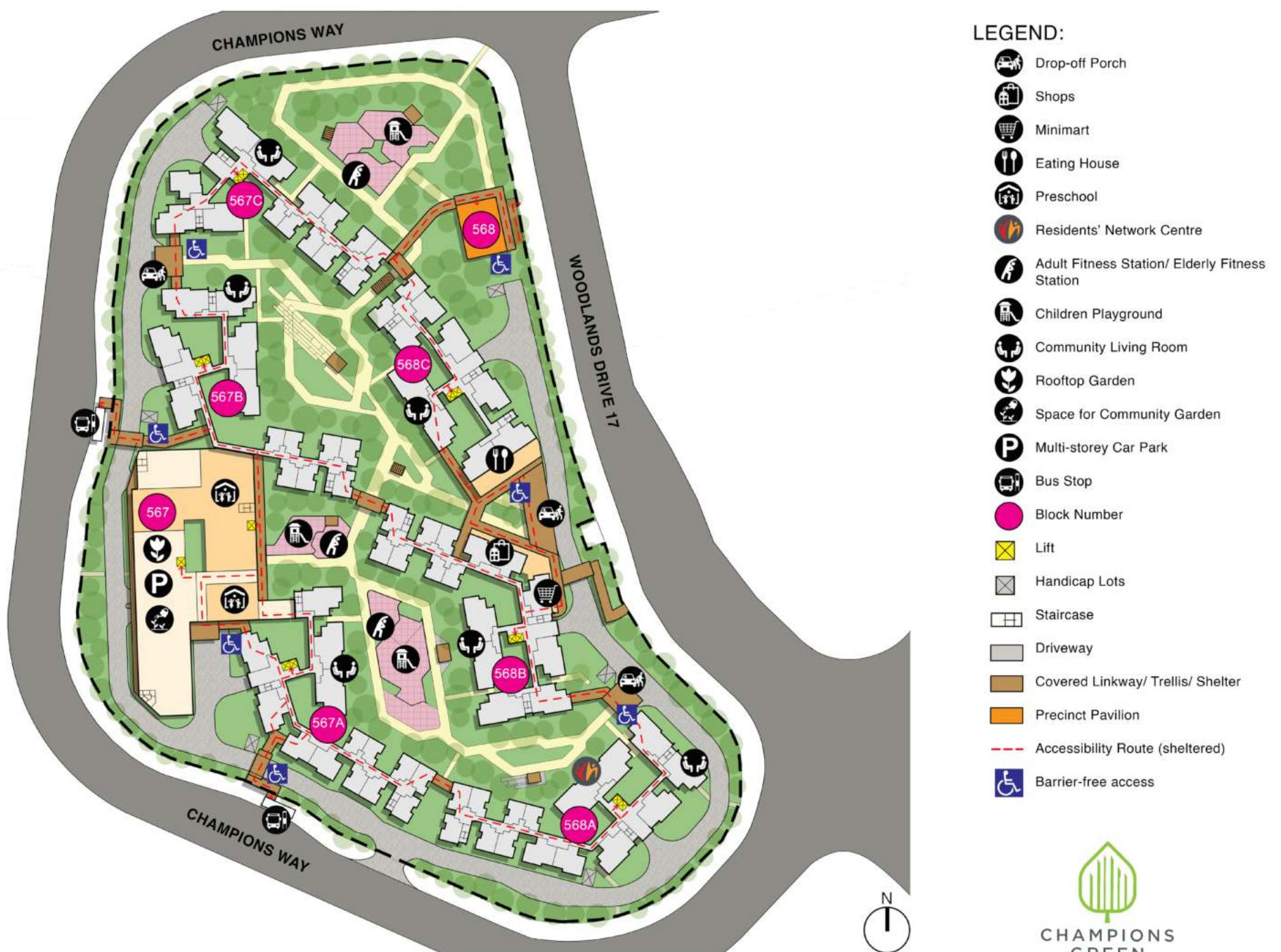
Site plan for Champions Green

இம்மேம்பாட்டிற்கு, குடியிருப்பு பேட்டையில் சுகாதாரமான மற்றும் துடிப்பான வாழ்க்கைமுறையை ஊக்குவிக்கும் விதமாக வடிவமைக்கப்பட்டுள்ள பசுமையான வெளிகளினால் 'Champions Green' என்று பெயரிடப்பட்டுள்ளது.