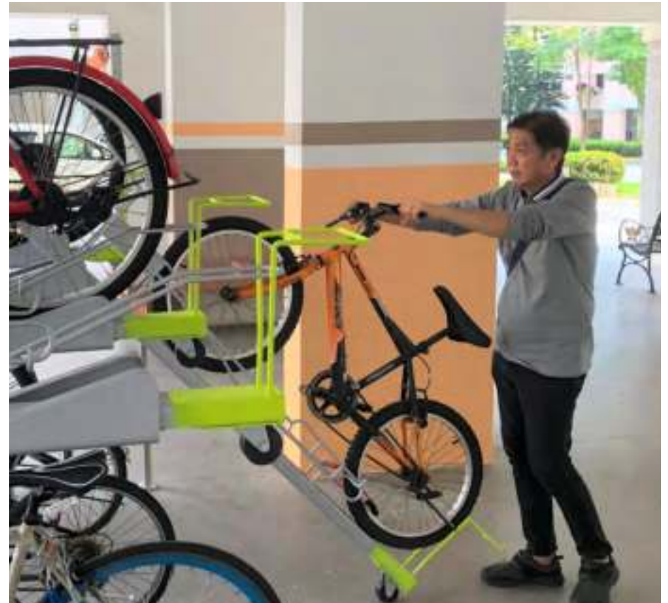
Bicycle stands to encourage cycling