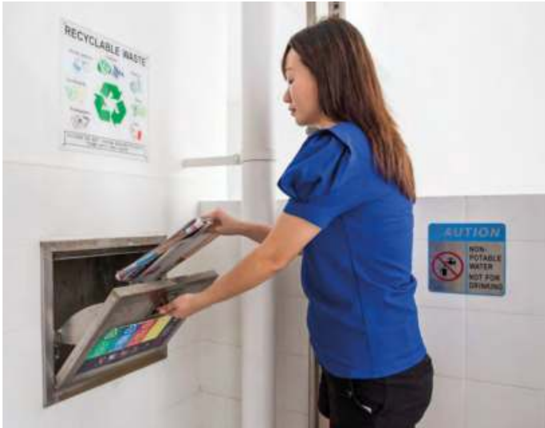
Separate chutes for recyclable waste