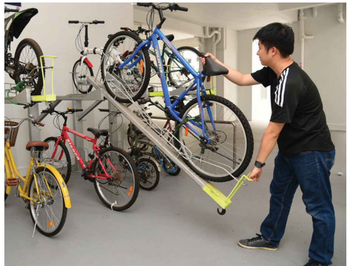
Bicycle stands to encourage cycling