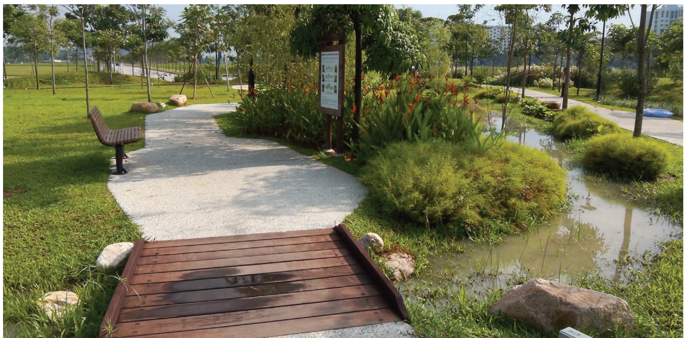
ABC Waters design features