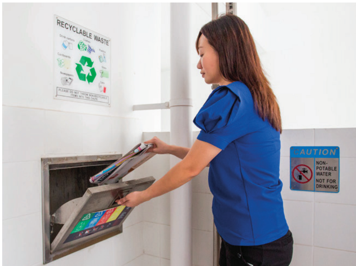
Separate chutes for recyclable waste