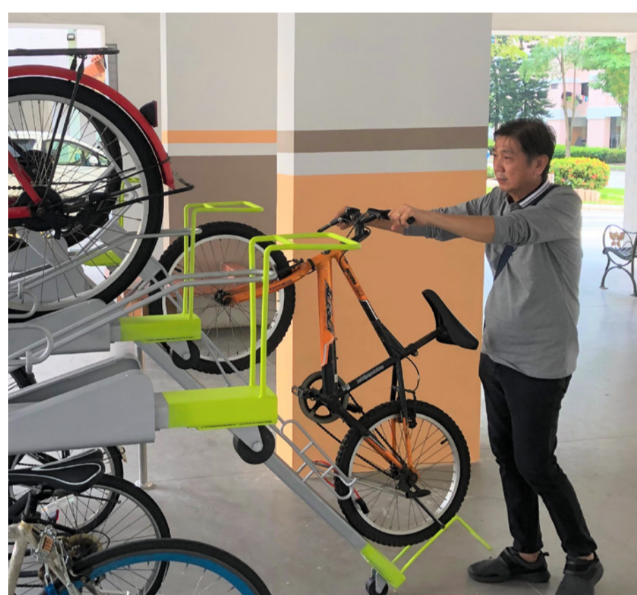
Bicycle stands to encourage cycling