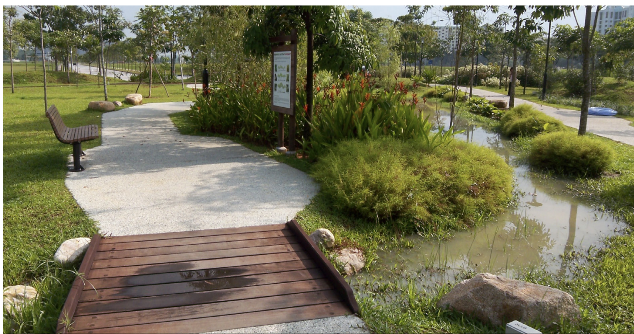
ABC Waters design features

© 2024 Housing & Development Board. All rights reserved.