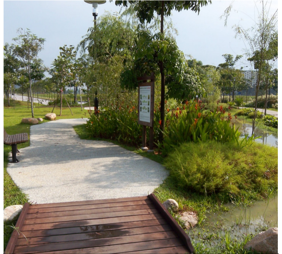
ABC Waters design features