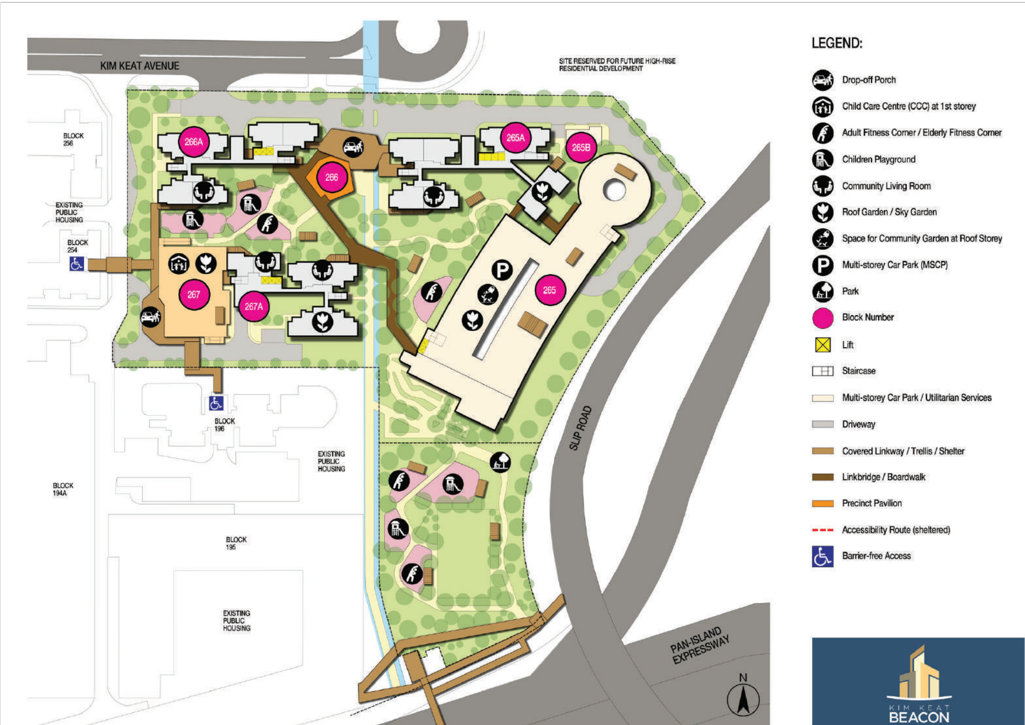
Site plan for Kim Keat Beacon

இந்த மேம்பாட்டின் வானளாவிய உயரம் மற்றும் அமைவிடம் காரணமாக இதற்கு Kim Keat Beacon என்று பெயரிடப்பட்டுள்ளது.