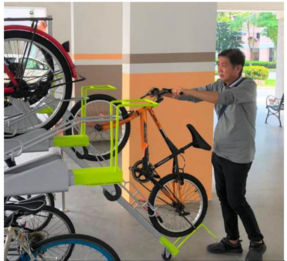
Bicycle stands to encourage cycling