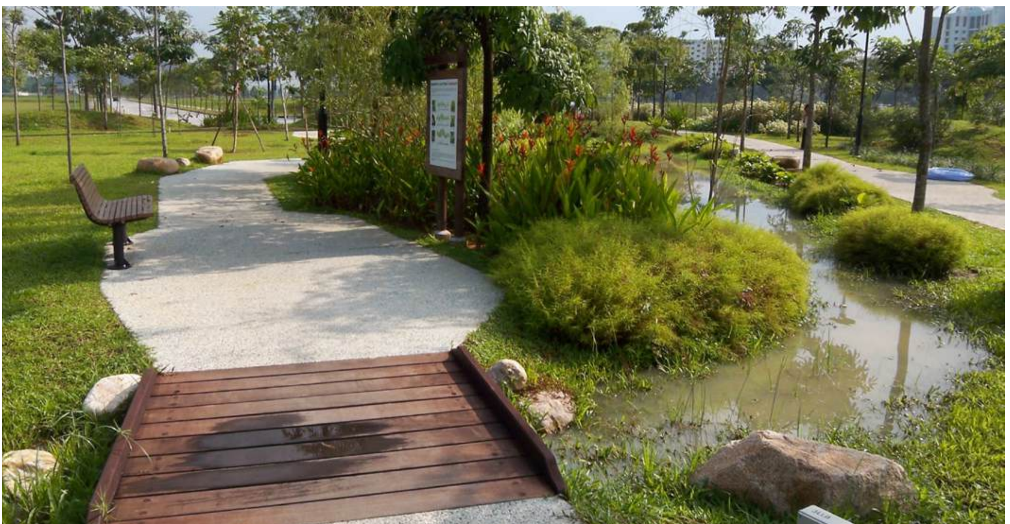
ABC Waters design features

© 2024 Housing & Development Board. All rights reserved.