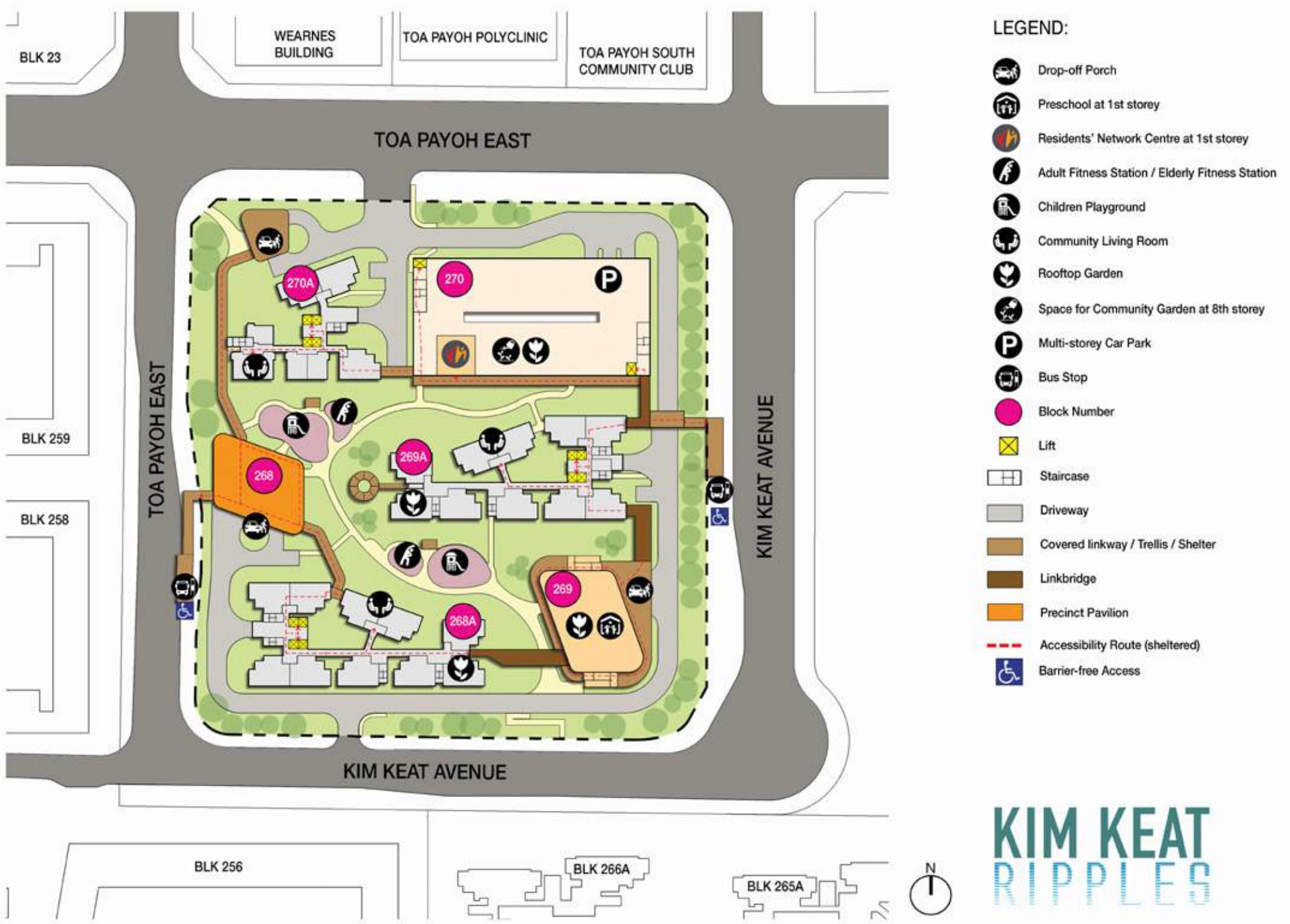
Site plan for Kim Keat Ripples

Kim Keat Ripples அருகிலுள்ள காலாங் ஆற்றை உத்வேகமாகக் கொண்டதால் அதன் நிலத்தோற்றம், கட்டட முகப்பு ஆகியவை சிற்றலைகள் ஒன்றிணைந்து இரண்டறக் கலப்பதுபோன்றே வடிவமைக்கப்பட்டுள்ளது.