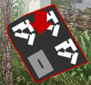
View from playground

In each residential block, sky terraces serve as social spaces, which seamlessly connects to the roof garden via link bridges. The roof garden offers a blend of fitness amenities and relaxation spaces. Together with the sky terraces, they create a loop of both active and passive spaces, ensuring a diverse range of green areas can be appreciated across various levels, extending beyond ground level.