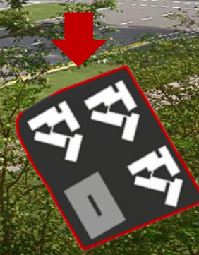
View from Tampines Street 64