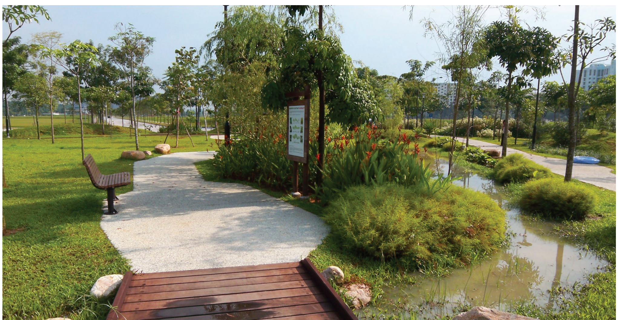
ABC Waters design features

© 2022 Housing & Development Board. All rights reserved.