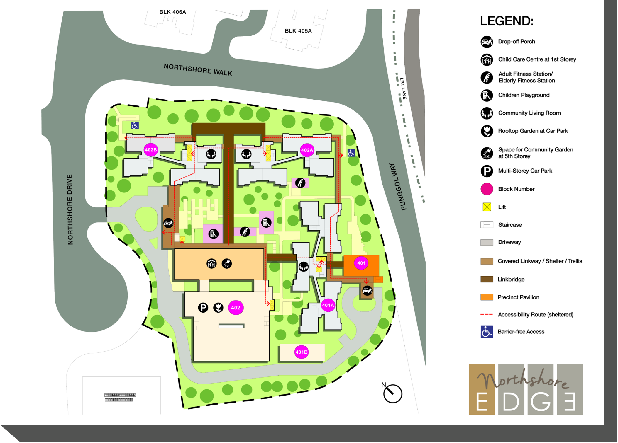
Site plan for Northshore Edge

Northshore Edge, பொங்கோல் ஈகோ டவுனின் நார்த்ஷோர் மாவட்டத்தில் அமைந்துள்ளது, மேலும் இது நார்த்ஷோர் டிரைவ் மற்றும் பொங்கோல் வே ஆகியவற்றினால் சூழப்பட்டுள்ளது. Northshore Edge, 21 முதல் 22 வரையிலான அடுக்குமாடிகளுடன் 3 குடியிருப்பு புளோக்குகளைக் கொண்டுள்ளது. இதில் 4 அறைகள் மற்றும் 5 அறைகள் கொண்ட வீடுகள் என மொத்தம் 388 வீடுகள் உள்ளன. ‘Northshore Edge’ என்ற பெயர் நார்த்ஷோர் மாவட்டத்தின் சுற்றுப்பகுதியில் உள்ள கட்டுமானத்தின் அமைவிடத்தை சான்றாதாரமாகக் கொண்டுள்ளது.