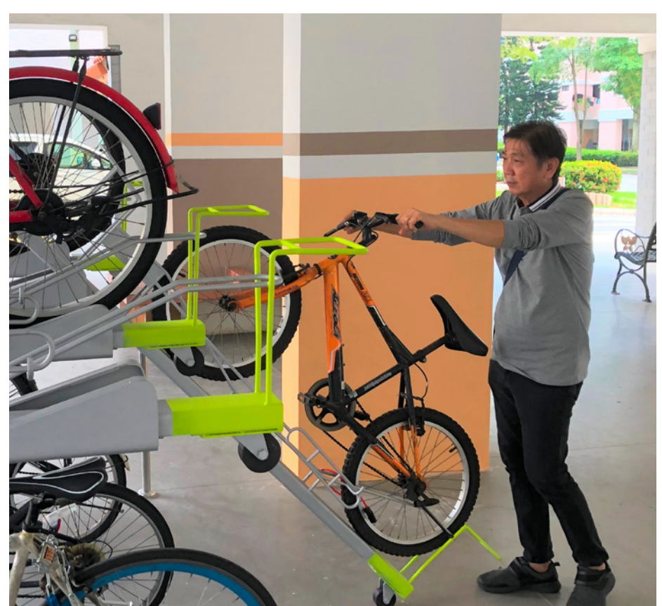
Bicycle stands to encourage cycling