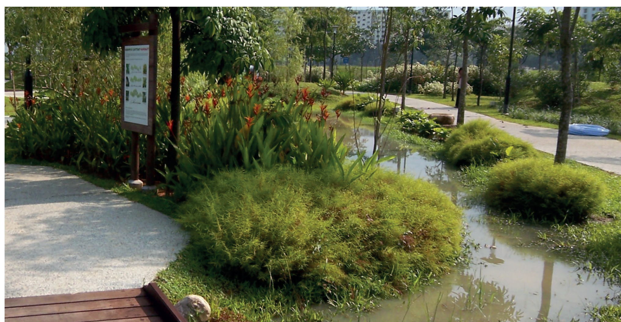
ABC Waters design features