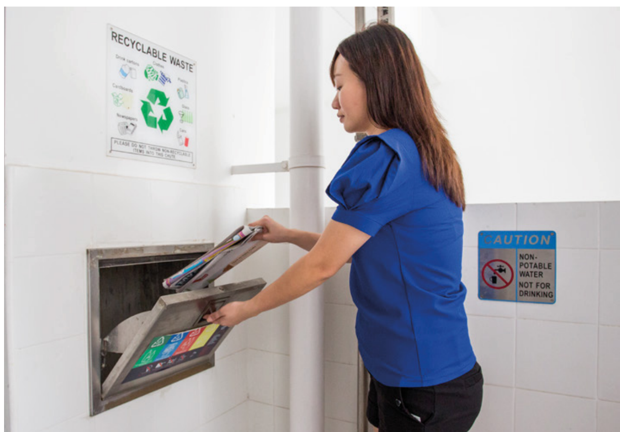
Separate chutes for recyclable waste

To encourage a “green” lifestyle, Senja Valley is designed with several eco-friendly features. These include separate chutes for recyclable waste; regenerative lifts and motion sensor-controlled energy efficient lighting at staircases to reduce energy consumption; eco-pedestals in bathrooms to encourage water conservation and bicycle stands to encourage cycling as an environmentally friendly form of transport.